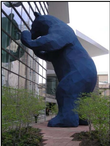
Yes, there was a very large blue bear!