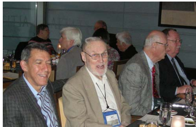
At the Annual Dinner at the Altitude Restaurant at Denver's Convention Center Hyatt Hotel