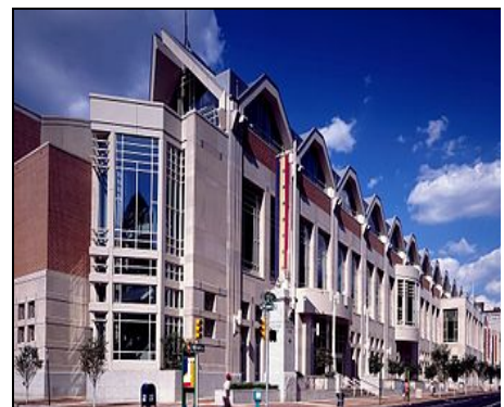
Pennsylvania Convention Center

Located in the heart of the City of Philadelphia -- both geographically and culturally -- the Convention Center boasts famed landmarks within short walks, including Independence Hall in America's most historic square mile, Chinatown and its stunning Friendship Gate, and Rittenhouse Square. Outside of the western entrance is the Museum Mile which stretches along Benjamin Franklin Parkway. The Center is the culinary melting pot known as Reading Terminal Market, which offers a vast choice of mouthwatering regional and international food.