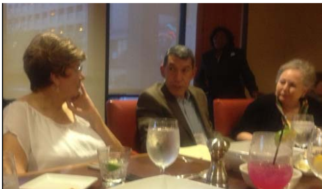
Above and below↑↓ at the Annual Dinner at the Cactus Flower Restaurant, San Antonio Marriott Riverwalk.