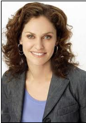
Amy Brenneman of TV's Judging Amy and Private Practice

M ore than 4,000 special and gifted educators arrived in San Antonio to take part in more than 1,000 educational sessions and nearly 200 business and social events, a buzzing Expo Hall and invaluable networking opportunities.