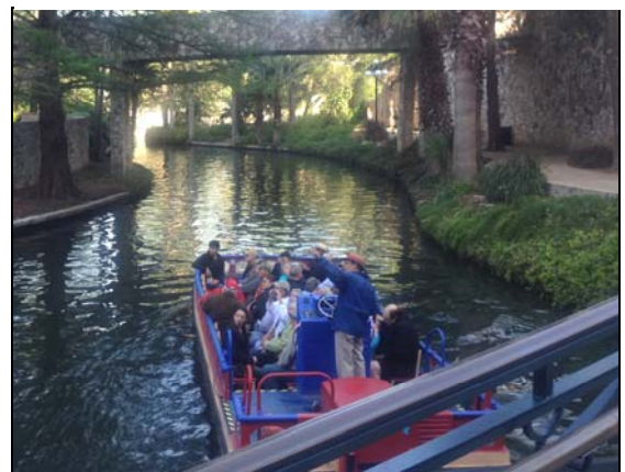
Along the San Antonio Riverwalk . . .