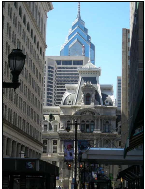
Downtown Philadelphia soars