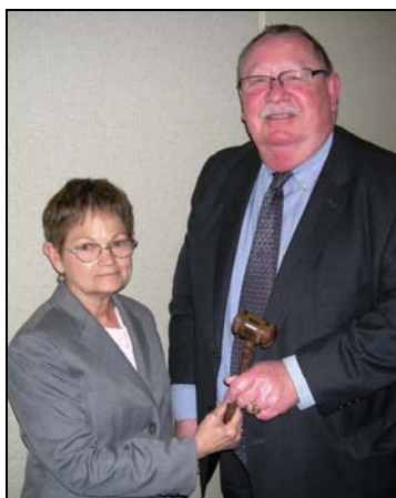
Passing the Gavel . . .