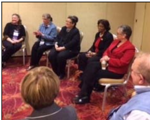
The CEC-PD Showcase Panel on Friday, April 11, 2014

Registration for CEC 2015 is now open and our special advanced pricing offer is available again! Register now through September 30 , and we'll honor our 2014 early-bird rates—guaranteed to be the lowest rate available. CEC members can register for just $334! What better way to use any year-end funds and further your professional growth? Take advantage of this incredible offer and get the lowest rates possible. We look forward to seeing you next spring in San Diego!