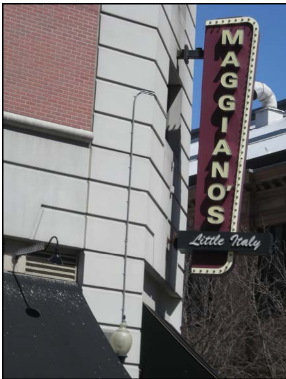
The CEC-PD Annual Dinner was at Maggiano's