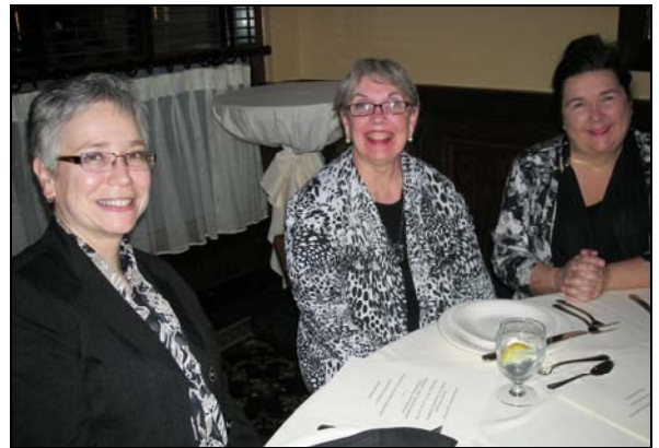
Getting ready for dinner at Maggiano's.