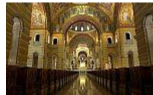
Cathedral Basilica of Saint Louis (New Cathedral)

Explore 700-plus exhibits, the OMNIMAX® Theater, James S. McDonnell Planetarium, special traveling exhibitions, and more. Group rates available. Open daily. General admission is always free.