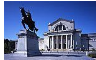
Saint Louis Art Museum

Built as the Fine Arts Palace of the 1904 World's Fair and one of the nation's leading comprehensive art museums. Collections include works of art of exceptional quality from virtually every culture and time period. Highlights include free admission to special exhibitions on Fri. and programs that range from films to performances. FREE