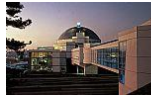
Saint Louis Science Center

Built as the Fine Arts Palace of the 1904 World's Fair and one of the nation's leading comprehensive art museums. Collections include works of art of exceptional quality from virtually every culture and time period. Highlights include free admission to special exhibitions on Fri. and programs that range from films to performances. FREE